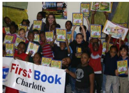
Book distribution party with the children of A Child's Place.

Be sure to visit our website: www.FirstBookCharlotte.org , to find out about some exciting volunteer opportunities as we celebrate book distributions with our new recipient groups. Watch newsstands for the August issue of "Charlotte Magazine" which will feature an article on First Book-Charlotte.