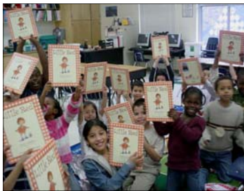
The children of Pinewood Elementary with their new books

All of the programs receiving books serve at risk youth, meaning that at least 80% of the children are from low-income households. Each book will be given to the child to take home as their very own.