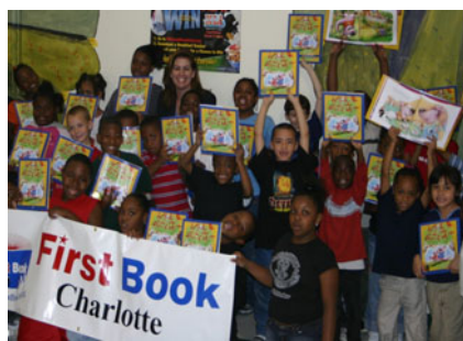
Book distribution party with the children of A Child's Place.