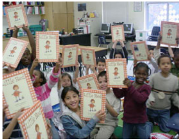
The children of Pinewood Elementary with their new books

All of the programs receiving books serve at risk youth, meaning that at least 80% of the children are from low-income households. Each book will be given to the child to take home as their very own.